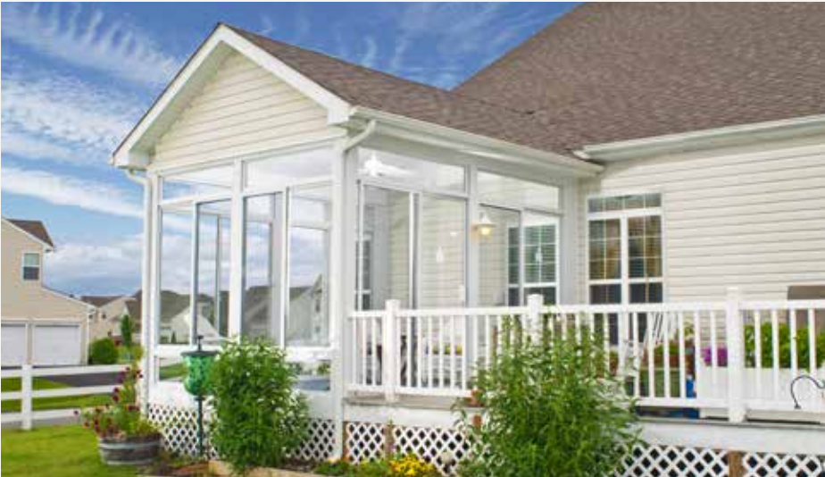
ENCLOSE YOUR PORCH