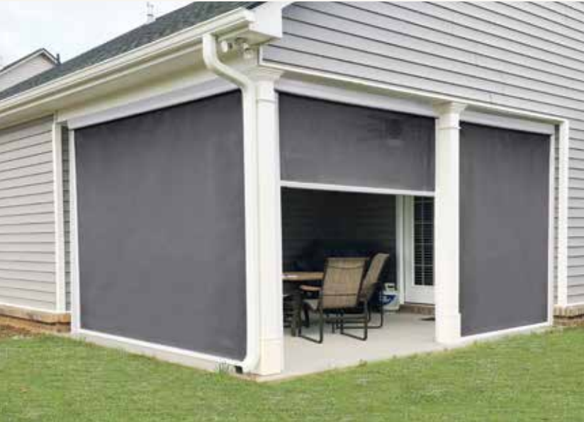
Our unique zipper system creates a completely closed shade - blocking out sun, wind and insects for easy outdoor living.