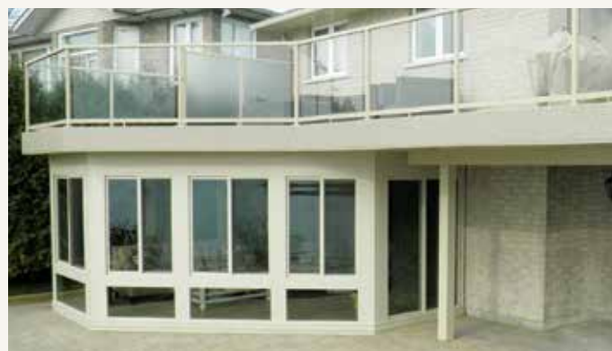
under your existing deck . . .