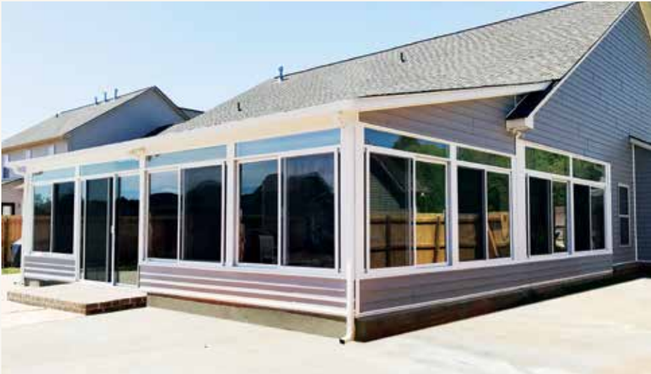
ENCLOSED PORCH / EXTENDED STUDIO