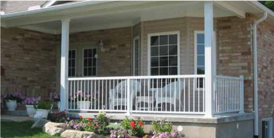
ALUMINUM PICKET RAILINGS