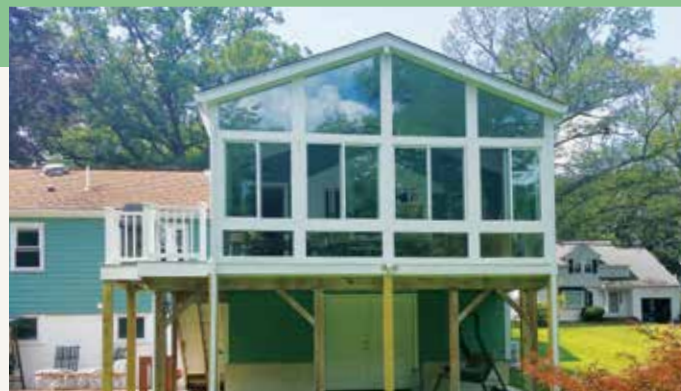
on your existing deck . . .