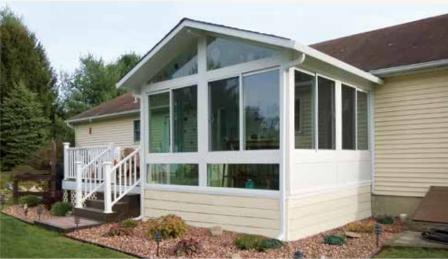
GLASS KNEEWALL AND PANEL KNEEWALL