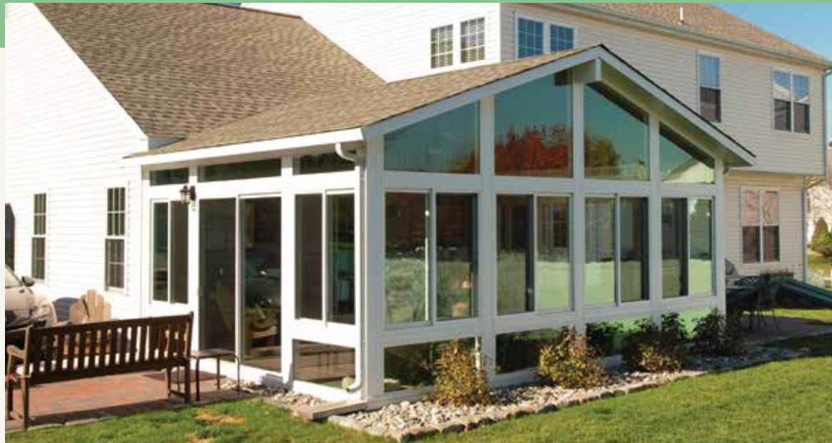
on your existing patio . . .