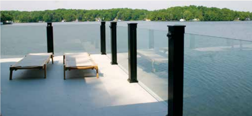
FRAMELESS GLASS RAILINGS