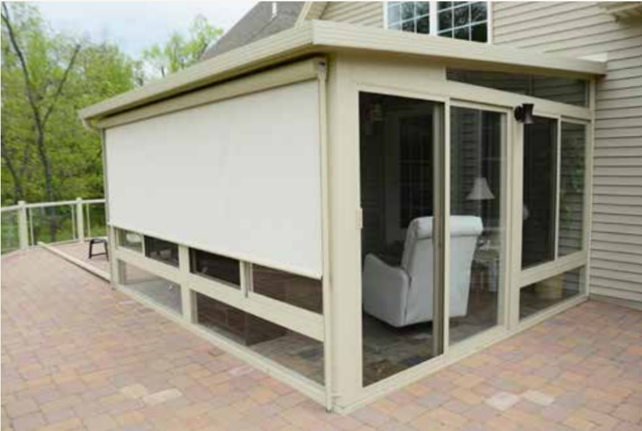
EXTERIOR SOLAR SHADES