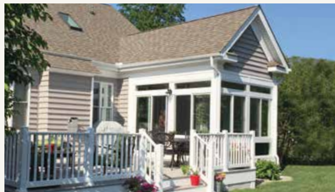
to enclose your existing porch . . .