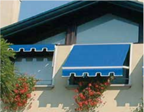
WINDOW & DOOR AWNINGS