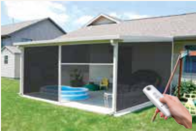
PATIO COVER WITH MOTORIZED SCREENS