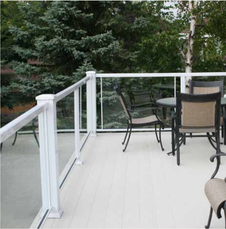
FRAMED GLASS RAILINGS