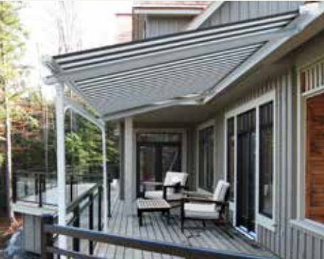
TENSION SHADE SYSTEMS