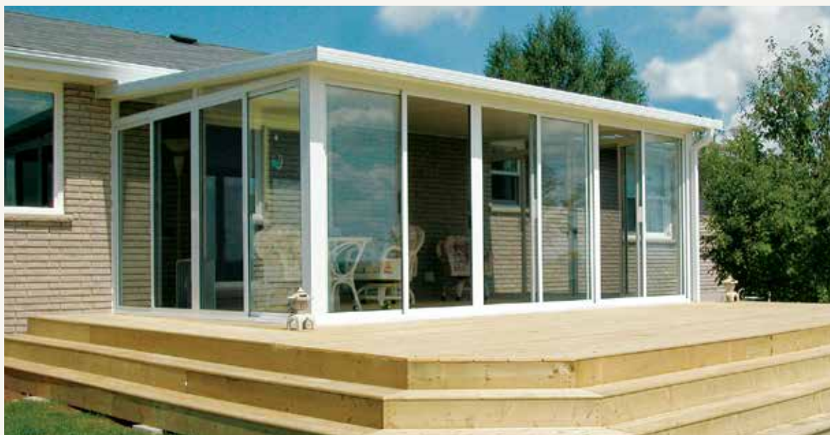
or on a new foundation we build for you!