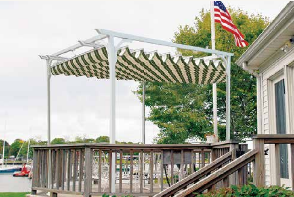
CANOPIES • PERGOLA CANOPIES

From adding cool shade on a hot deck or patio . . . to adding privacy and protection from the sun, wind or bugs . . . our durable, long-lasting fabric structures are the energy-saving solutions you need to create shady retreats for summer enjoyment. Request our extensive Betterliving shade brochure to learn more about our entire shade product line.